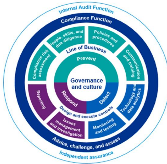
Illustration I: The Compliance Program of Aygaz Group

Prevention is managed through Compliance risk assessments, due diligence practices, written policies and procedures as well as communication and trainings. Detection, is supported by technology and data analysis as well as monitoring, testing and audit practices. Response refers to investigations and reporting activities.